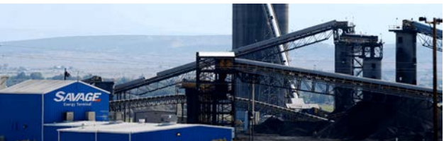
Ports & Terminals