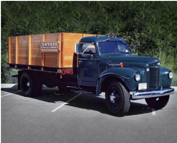
The first Savage truck from 1946