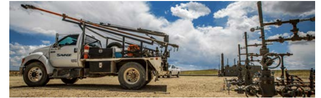
Oil & Gas