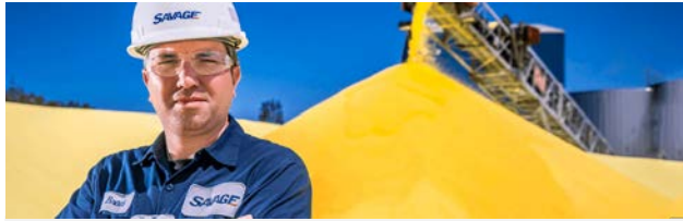
Food & Agriculture