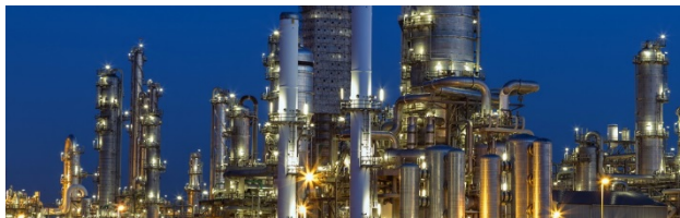
Chemicals & Petrochemicals